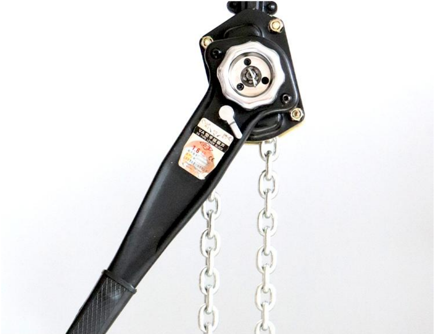
3..Build-in mechanical load brake.Two swivel hook with safety latches